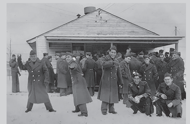
Camp Grant, Illinois 1941